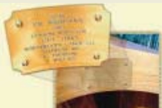
Each canoe is delivered with a personalized brass plate

While we strictly adhere to traditional construction methods and material, certain options are available to satisfy individual requirements. These include: mahogany or cherry rails, thwarts and seats, sailing rigs, half ribs, special light weight models, durable and attractive shellac bottom paint, two-tone paint, outside stems, keels, and hand caned seats. Please inquire about any additional options or additions